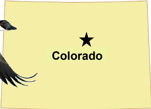
WELD COUNTY, COLORADO